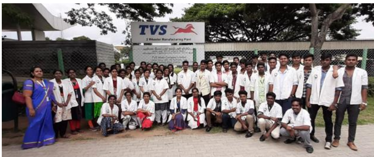
Industrial Visit at TVS Motors, Hosur