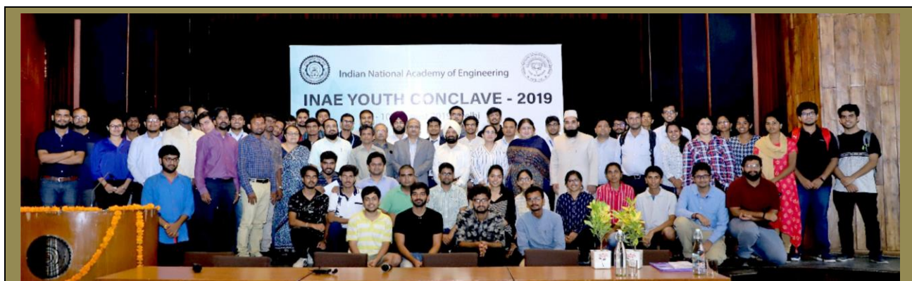
INAE Award- Indian National Academy of Engineering - Youth Conclave 2019

Curricular activities have a number of values like educational value, development of social spirit and worthy use of leisure time. Our students have succeeded reaching greater heights by winning awards and Travel Grants in National and International Level Contest, publishing papers in various international journals and conferences. The following are glimpses of few honours achieved by our students.