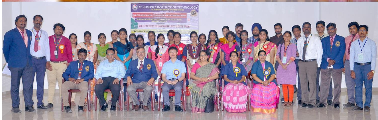
IEEE Photonics Society (PS) Distinguished Lecture's Talk On "Photonics for Broadband Microwave Measurement"