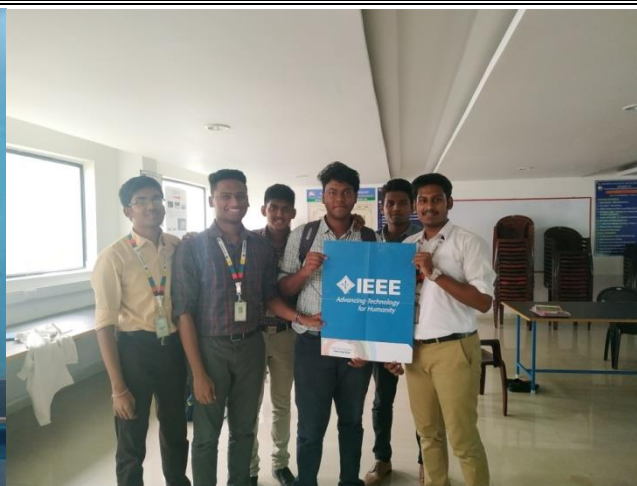
Antenna Tech Gap