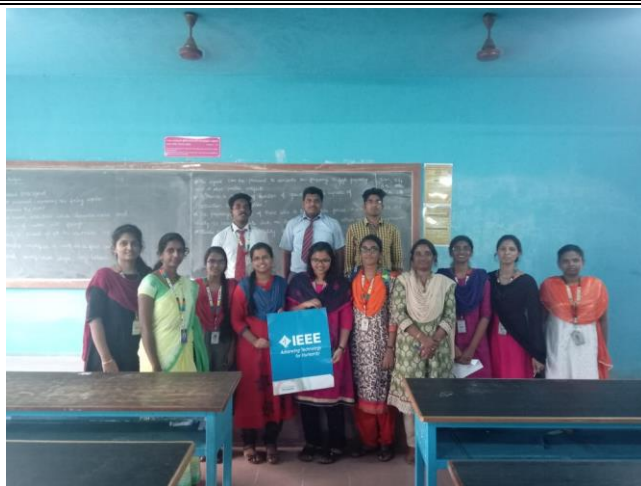
Doodle for Women Empowerment