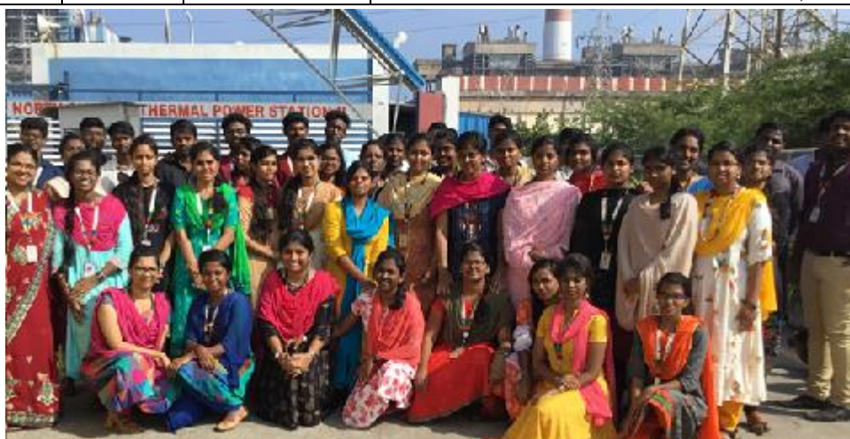
North Chennai Thermal Power Plant, Ennore