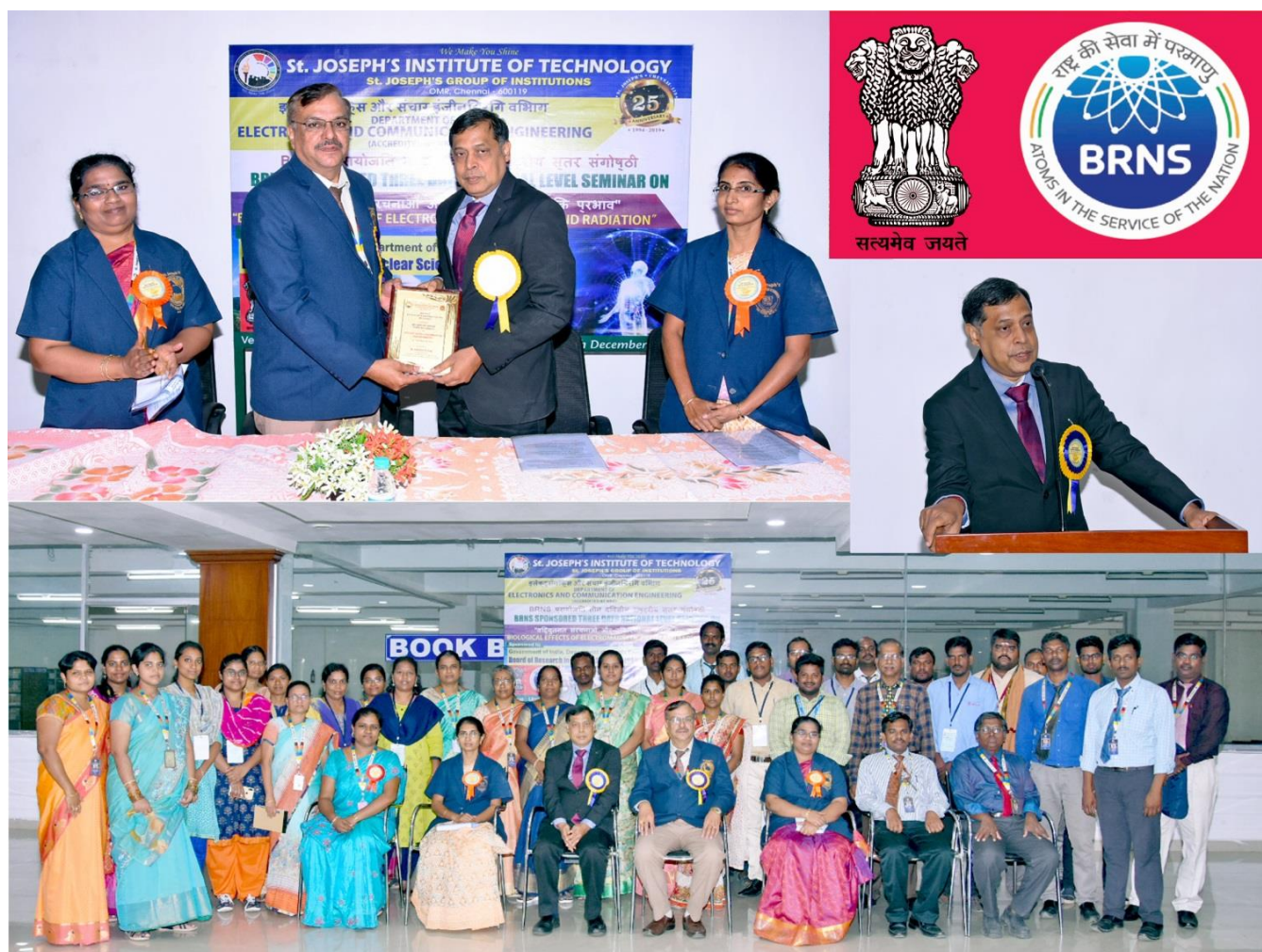
National level Workshop on “ Biological Effects of Electromagnetic Fields and Radiations ” Sponsored by Government of India, Department of Atomic Energy, Board of Research in Nuclear Science (BRNS)