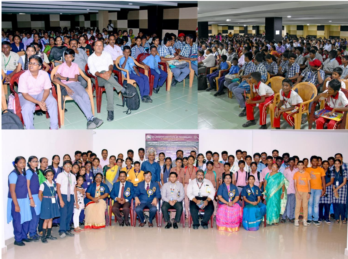
National Level School Competition “St. Joseph’s GENIUS ‘19”

No: of participants& Schools: 583 students & 38 Schools